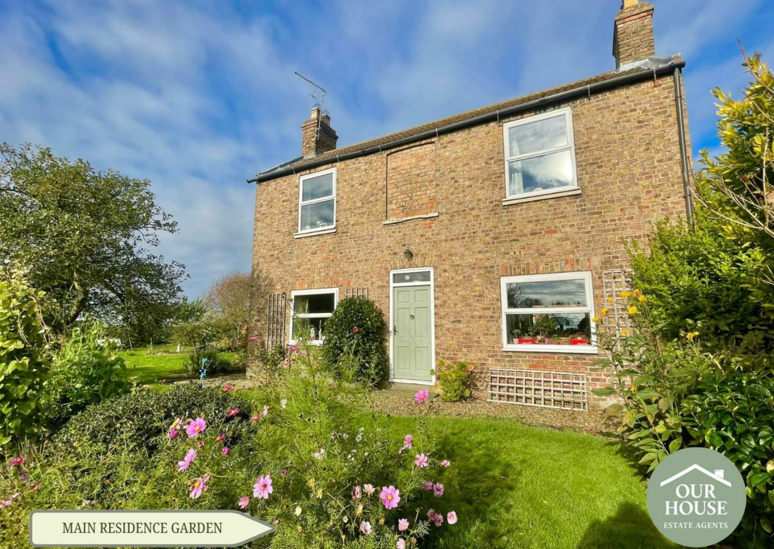
MAIN RESIDENCE GARDEN